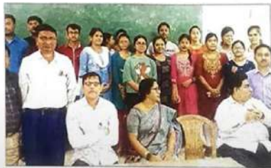
চন্দননগর খলিসানি মহাবিদ্যালয়ের থেকে ইতিমধ্যে ৩২ জন পড়ুয়া চাকরি পেয়েছেন

চন্দননগর খলিসানি মহাবিদ্যালয়। তার পড়ুয়াসের জন্য কলেজে ক্যাম্পাসিংয়ের ব্যবস্থা করেন। সেখানে থেকে পড়ুয়ারা চাকরি পান। বৃহত্তর কলেজে এসে চাকরিসমূহ ছাত্রছাত্রীরা কলেজের অধ্যক্ষের সঙ্গে দেখা করে উৎসাহ প্রকাশ করেন। এমন ঘটনা দুই একটা ঘটে না। তবে কলেজ কর্তৃপক্ষ যে এভাবে পড়ুয়ারের কথা কেনেছেন তা নিয়ে অস্বস্তি পড়ুয়া